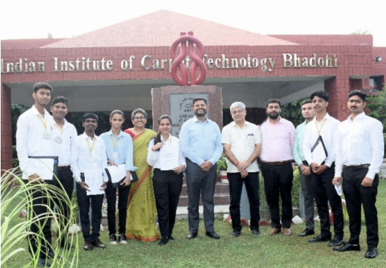
Campus Placement: Welspun, Mumbai