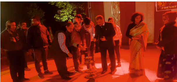
Fresher's Day, December 27, 2023